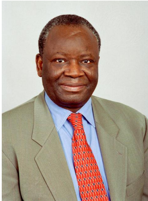
Prof. Ibrahim Agboola GAMBARI