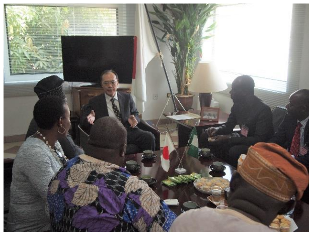
Conversation between Ambassador and representatives of two NGOs