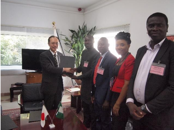
Ambassador and implementing partners of Enugu state at the signing ceremony