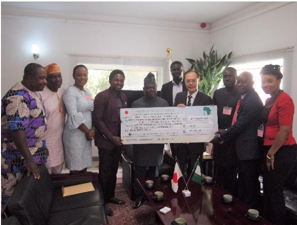
Group photograph with implementing partners