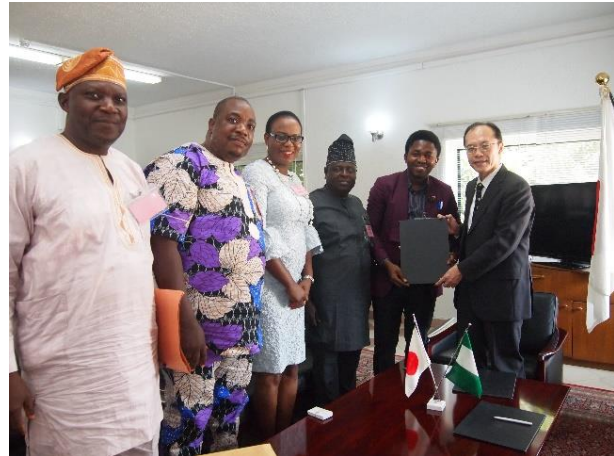
Ambassador and implementing partners of Ekiti state at the signing ceremony