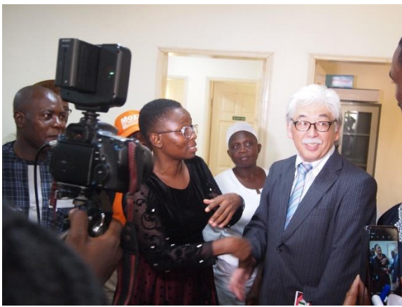
Chargé d'Affaires being welcomed by Executive Director, Street to School initiative