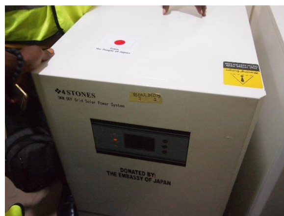
Installed Solar power system