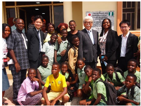
Chargé d'Affaires, representatives, and community people