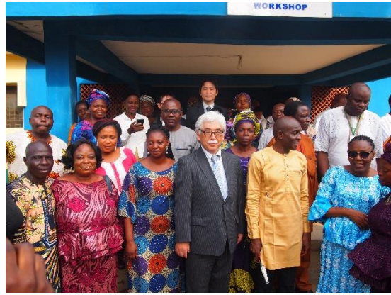
Chargé d'Affaires and representatives