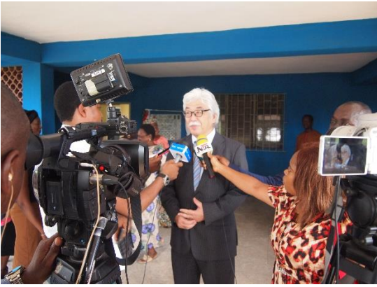
News reporters interviewing Chargé d'Affaires