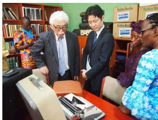
Chargé d’Affaires inspecting the equipment