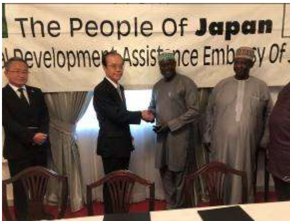
Grant contract signing between Ambassador and NADP