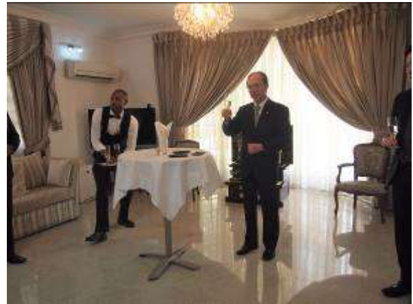
Ambassador delivering a speech