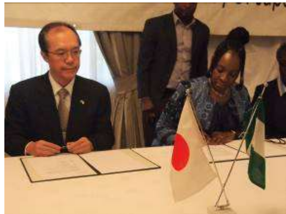
Grant contract signing between Ambassador and Tabitha Cumi Foundation