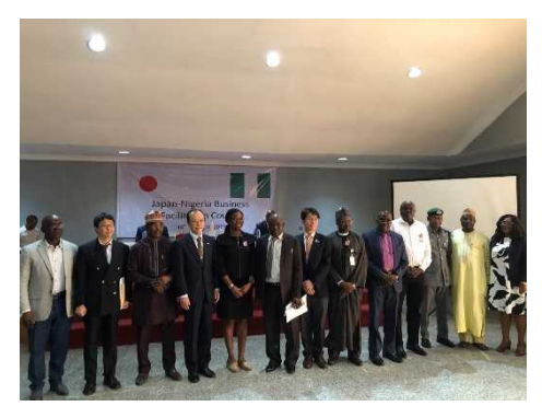
Co-Chairs and Council members