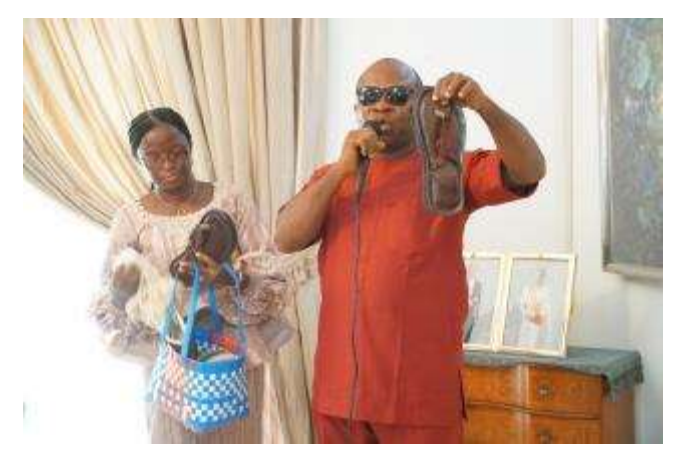
A graduate from Farmcraft Centre for the Blind showing his art crafts