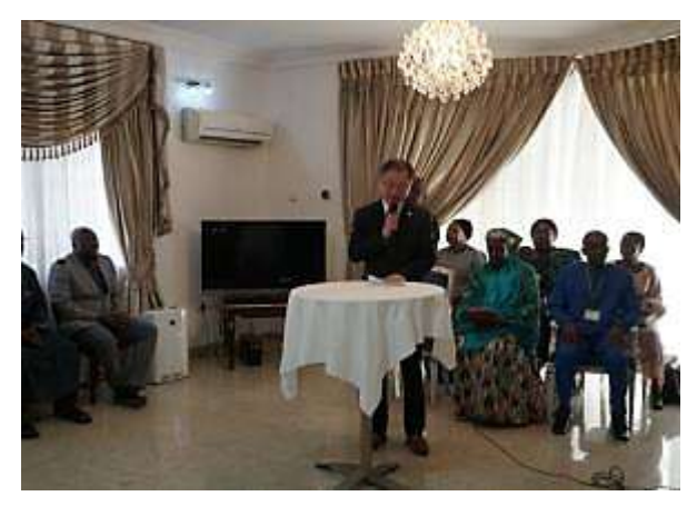
Charge d'Affairs giving speech