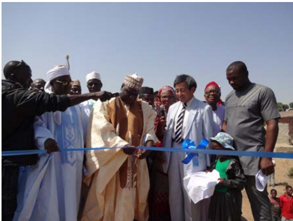
Commissioning the project