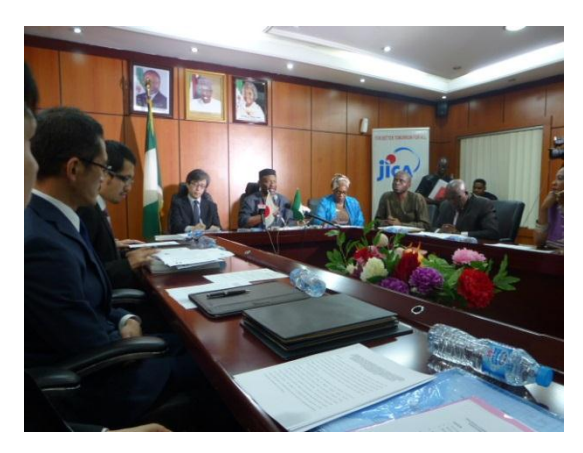
Overview of the venue