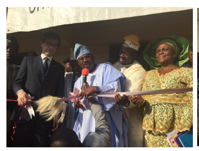
Tape cutting ceremony