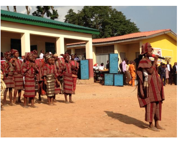
Dance and song by the students