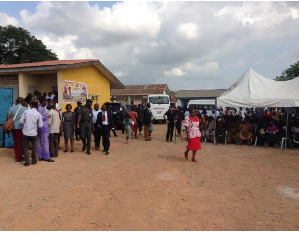
School ground at the ceremony