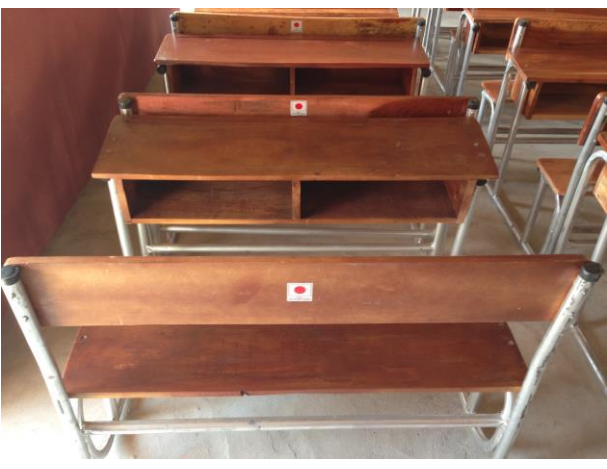
Chairs and desks provided by the Government of Japan