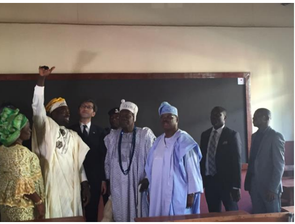
One of the classrooms at the school