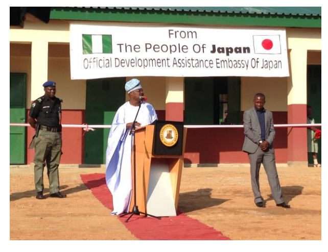
Speech by the Executive Governer