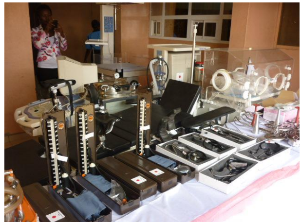
Newly granted medical equipment