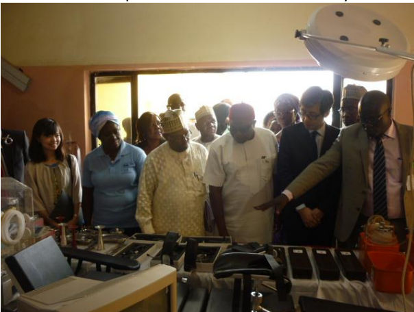
Hospital Director giving an explanation of each equipment