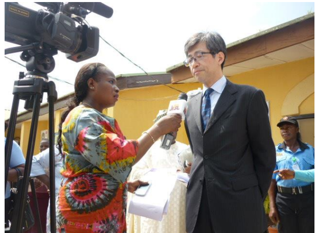
Ambassador Kusaoke interviewed by NTA